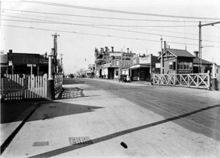
Crossing at St Georges Rd, view north.